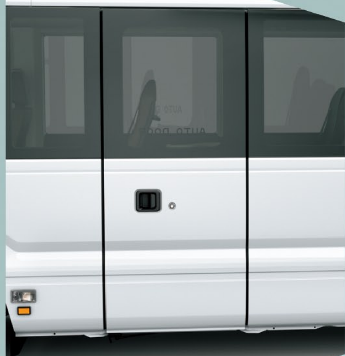
* Power sliding door 電動趟門，方便乘客上落