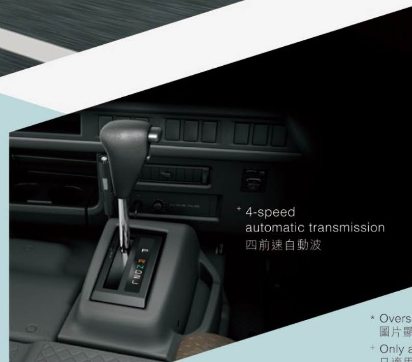
* 4-speed automatic transmission 四前速自動波

* Overseas model shown 圖片顯示為海外型號 * Only available in specific model 只適用於個別型號