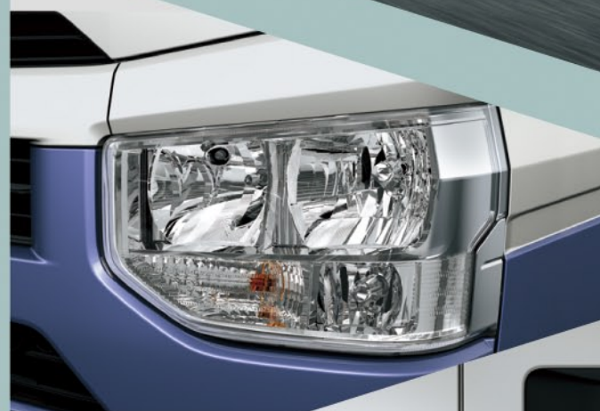
New headlamp and rear lamp 全新頭尾燈設計